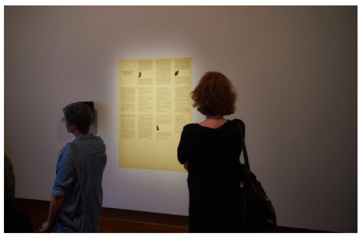
Somewhere in Between, Bozar, Brussels, 2018.