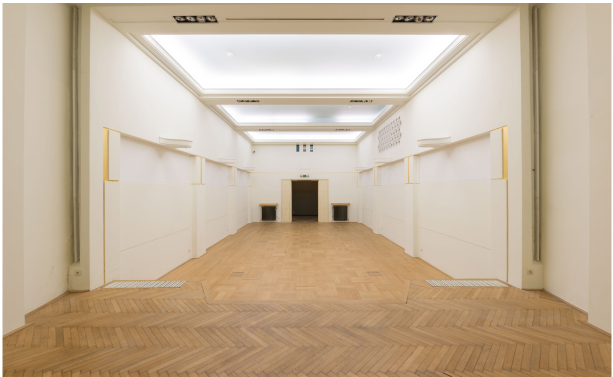
Views of the temple, ground floor