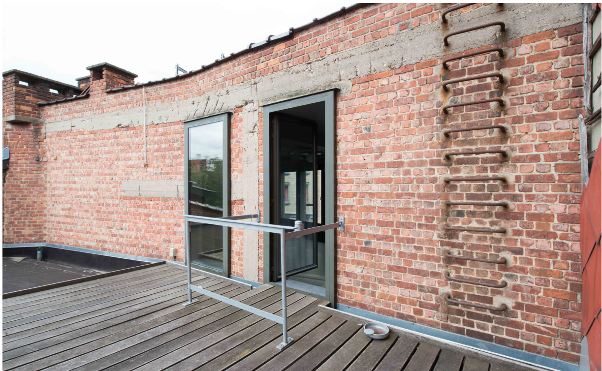
Views of the terrace