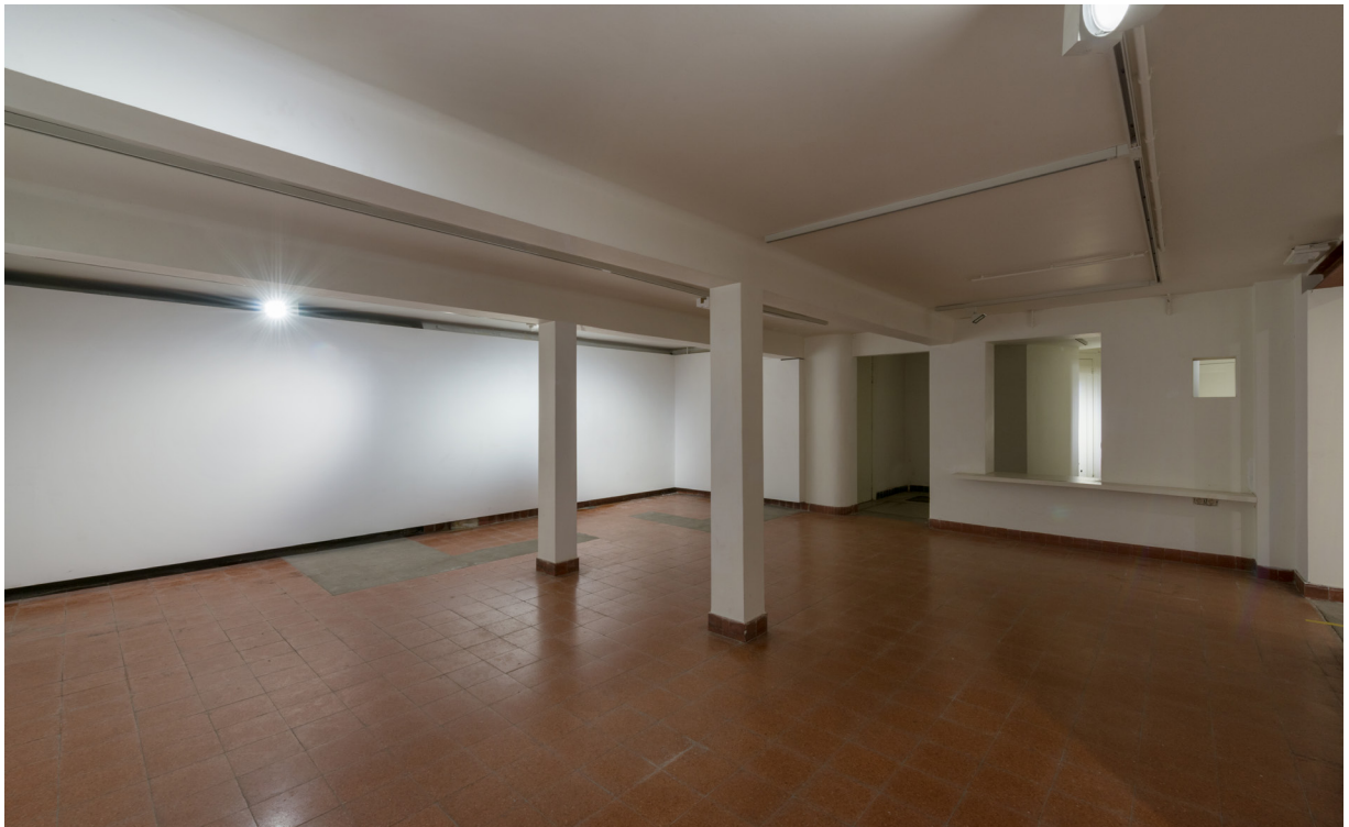
Views of the basement