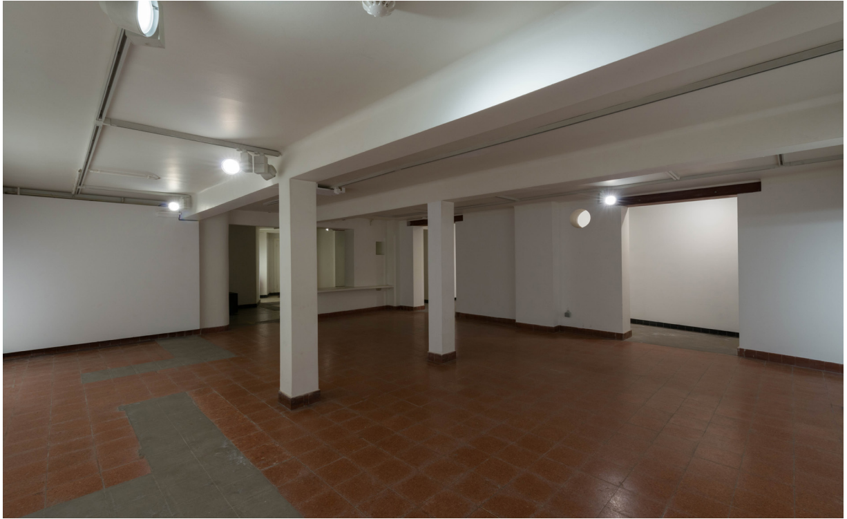
Views of the basement