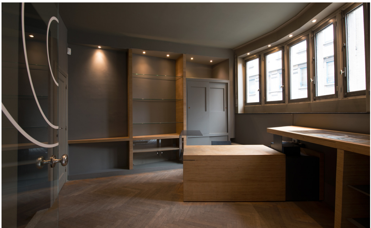
Views of La Loge from the outside and the lobby on the entrance