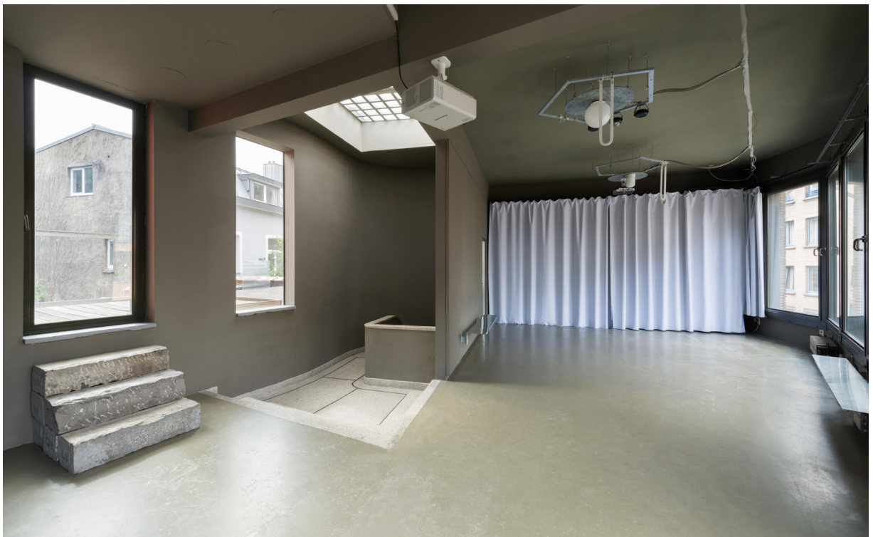
Views of the second floor