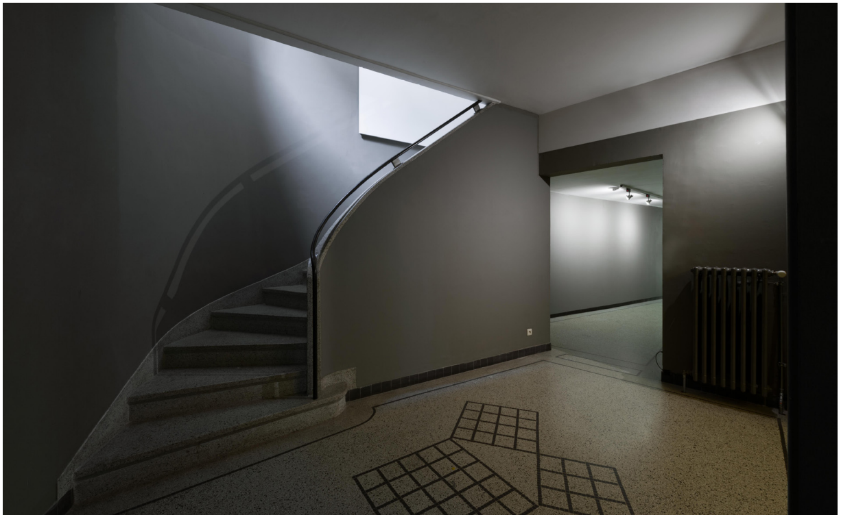
Views of the ground floor and the staircase leading to the first and second floors